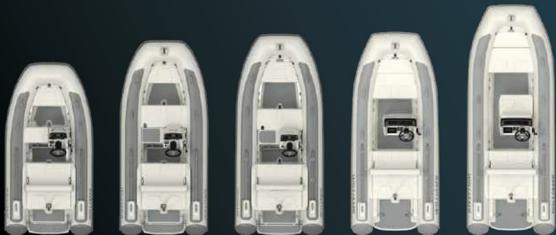
S P O R T J E T 345 5 PERSONS